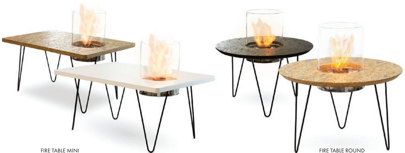
FIRE TABLE MINI