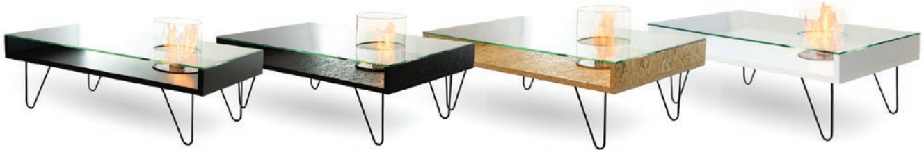
FIRE COFFEE TABLE

Commerce Technology™ (Absorbent Ceramic Fibers)